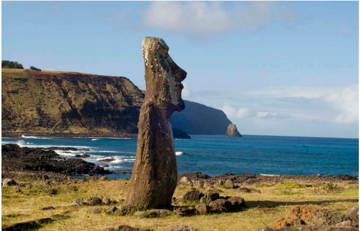
Moai overlooking the ocean